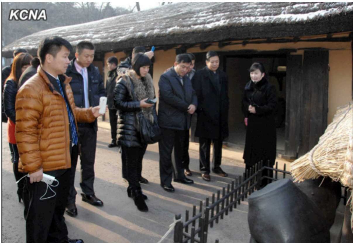
CHINESE OVERSEAS KOREANS VISIT MANGYONGDAE, FEBRUARY 15, 2014