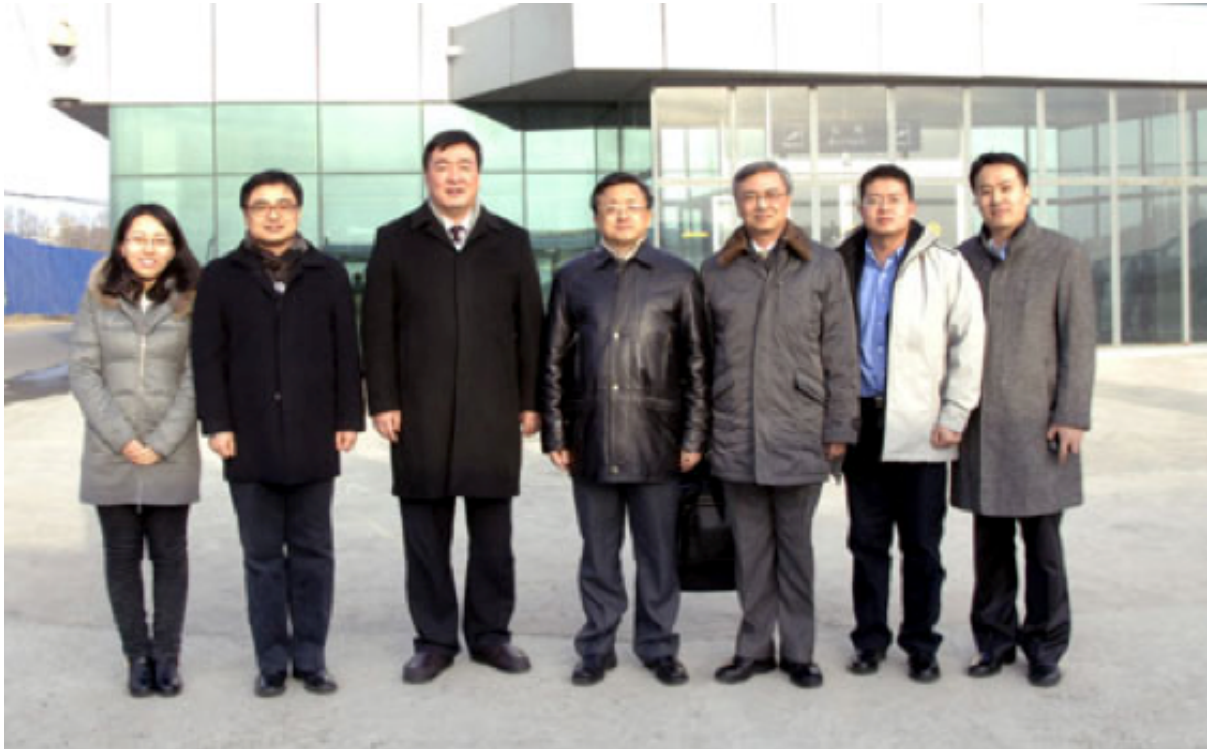
CHINESE FOREIGN MINISTRY DELEGATION ARRIVES, FEBRUARY 17, 2014