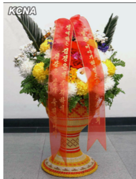
FLORAL BASKET FOR KIM JONG-UN