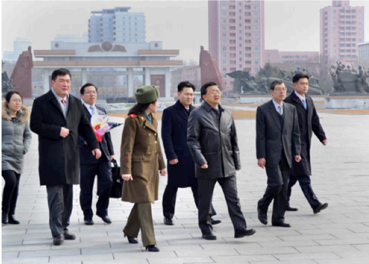
CHINESE DELEGATION VISITS PYONGYANG LANDMARKS, FEBRUARY 21, 2014